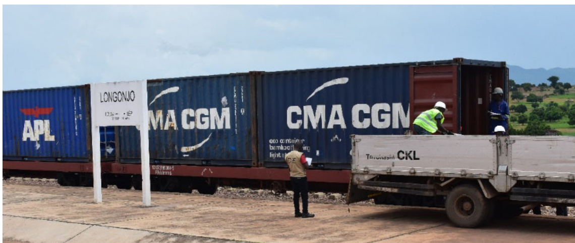
Loading samples into container for transportation to Port Lobito

In January 2020, the containers arrived at Fremantle Port and were trucked to ALS Metallurgy ahead of the planned pilot plant test-work programme.